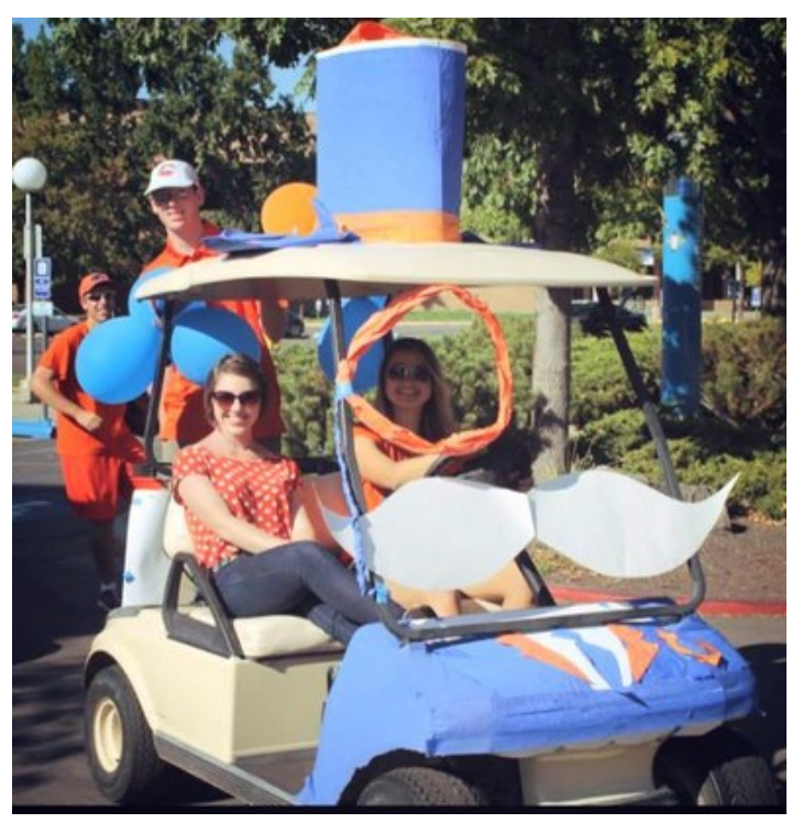
Homecoming Parade Float, 2014