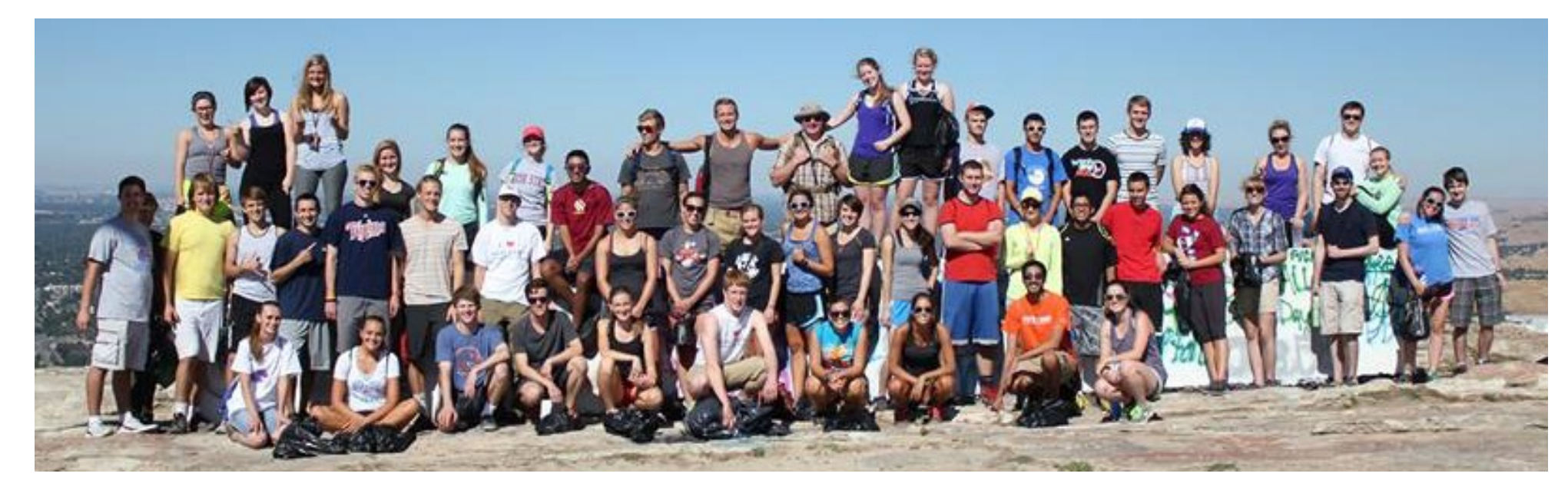
Participating in Clean Up Table Rock in Boise, 2014