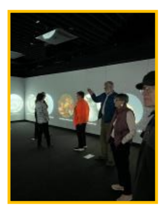
Clockwise: Top Left Emeriti members wait to enter the Luminary; NYC's Metropolitan Museum items; historical Medieval collections; live streaming Webb Space Telescope links; Emeriti members learning about the Luminary's capabilities.