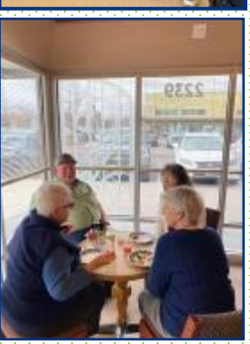
Holiday Emeriti Social, December 7, 2022