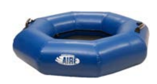
Deluxe River Tube