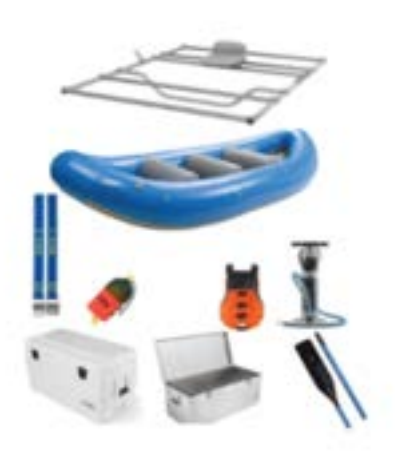
14' Row Package