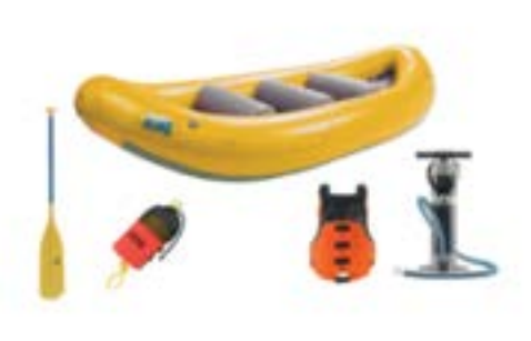
13' Super Puma Raft Paddle Package (7 people)