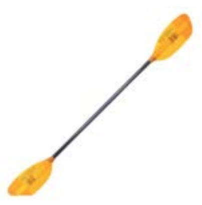
White Water Kayak Paddle