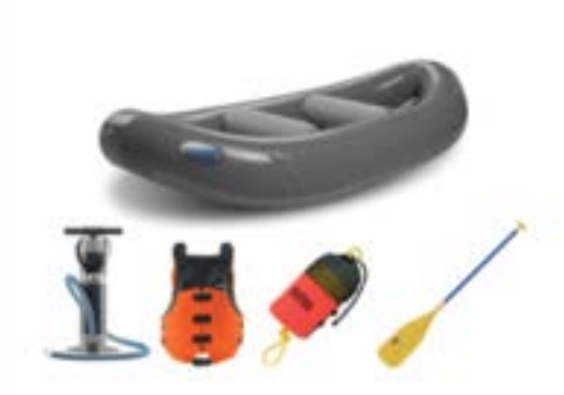
11'6" Puma Raft Paddle Package (4 people)