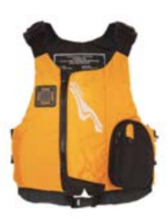
Type III Personal Floatation Device