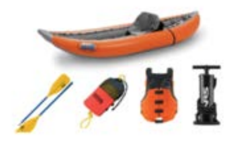
Inflatable Kayak Package (1 person)