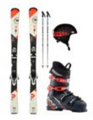
Alpine/Downhill Ski Package