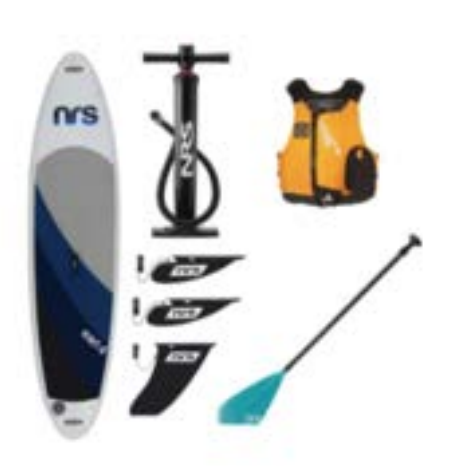
Inflatable Stand Up Paddleboard Package