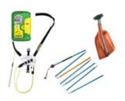
Avalanche Safety Kit