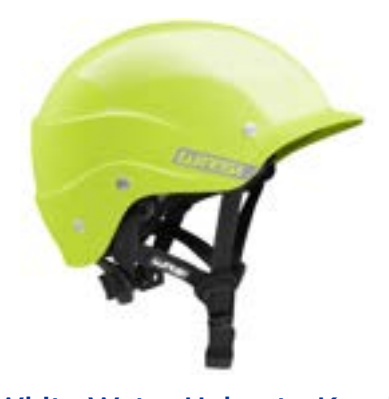
White Water Helmet - Kayak