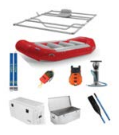
15' Row Package