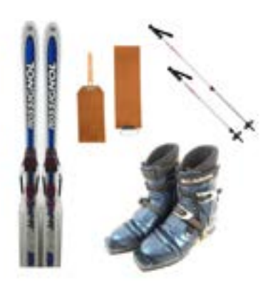
Telemark Ski Package