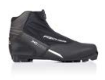
Cross Country Classic Ski Boots