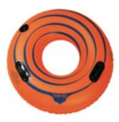
Basic River Tube