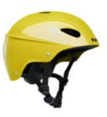
White Water Helmet