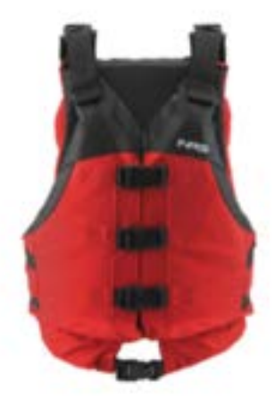
Type V Personal Floatation Device - Adult or Plus