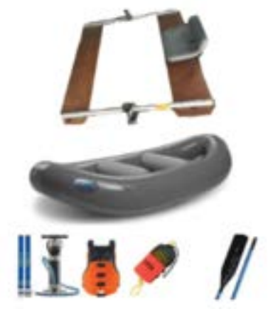
11'6" Puma Row Package