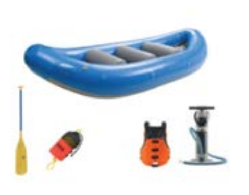
14' Raft Paddle Package (7 people)