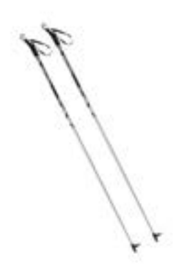
Cross Country Classic Ski Poles