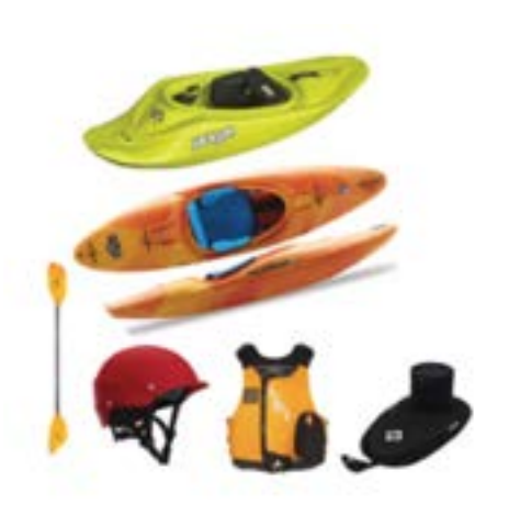
White Water Kayak Package