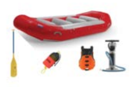
15' Raft Paddle Package (9 people)