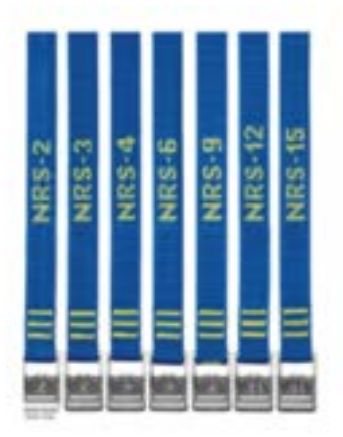
NRS Cam Strap Bag (4 of each: 2', 4', 6', 9' and 12')