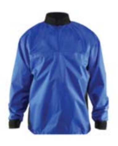
Adult Splash Jacket