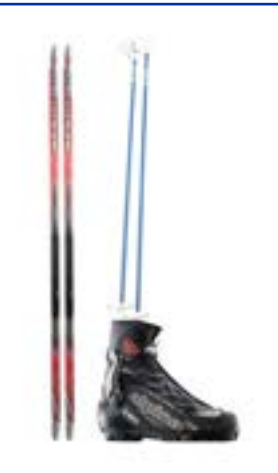
Cross Country Skate Ski Package