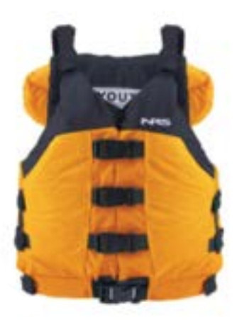
Type V Personal Floatation Device - Youth