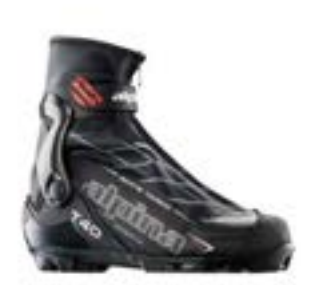
Cross Country Skate Ski Boots