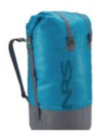
Dry Bag - 110L