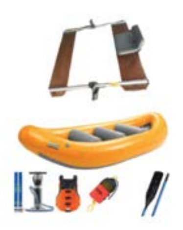
13' Super Puma Row Package