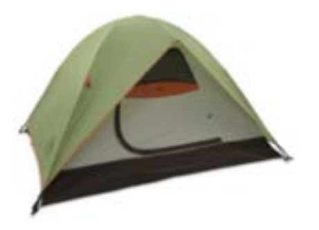
6 Person Tent