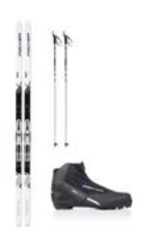
Cross Country Classic Ski Package