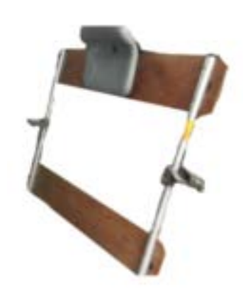
Puma & Super Frame