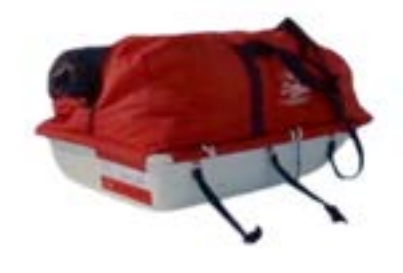
Snow Gear Sled