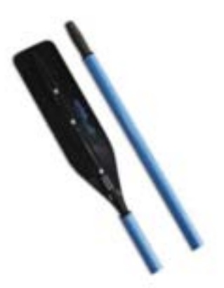
Oar - 7' 8' 9' 10'