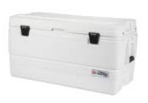
94 Quart Igloo Cooler