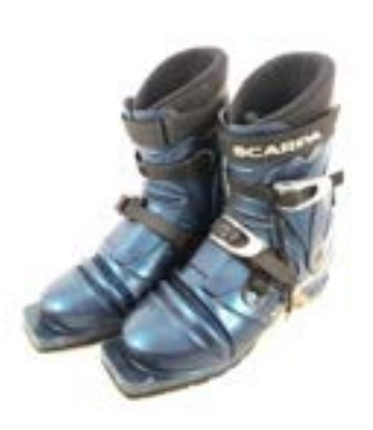
Telemark Ski Boots