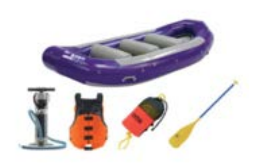
13' Raft Paddle Package (7 people)