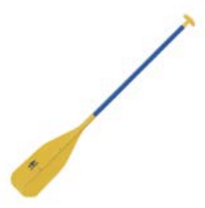
Raft Paddle - Crew