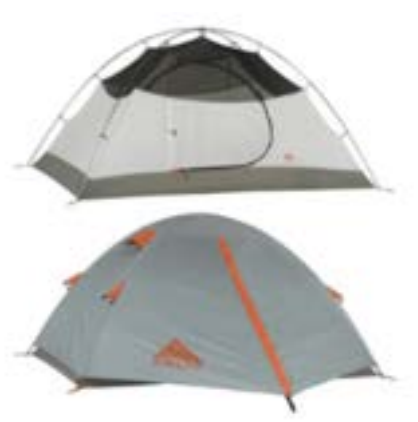
3 Person Tent