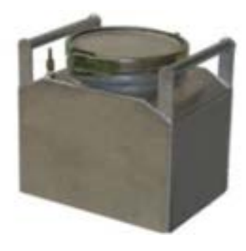
Groover Spare Tank (no seat)