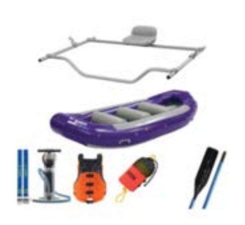
13' Row Package