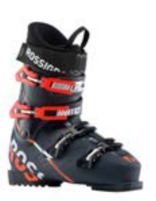
Alpine/Downhill Ski Boots