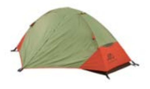
2 Person Tent