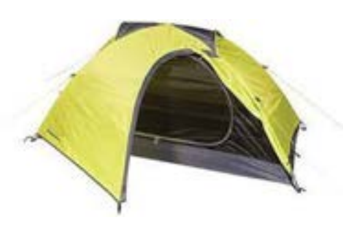
1 Person Tent