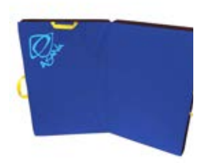
Bouldering Crash Pad