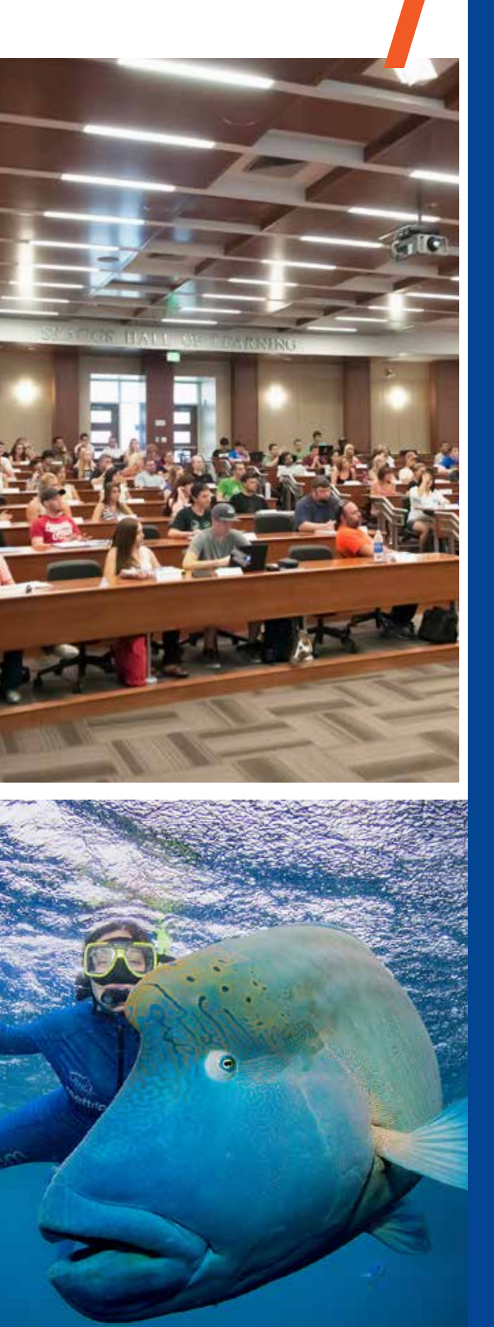
Student Amy Schneider near the Great Barrier Reef in Australia while on spring break with a global scholars program.