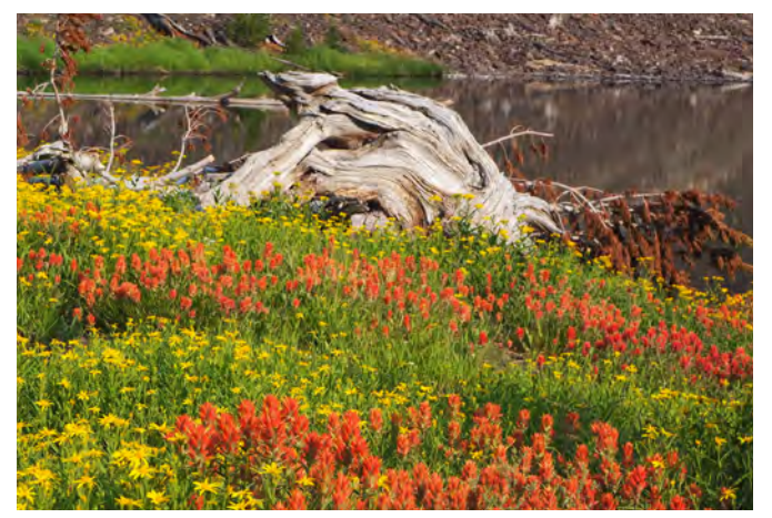
Thunder Lake in the spring.