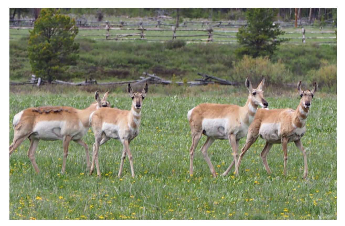
Pronghorn antelope in meadow.