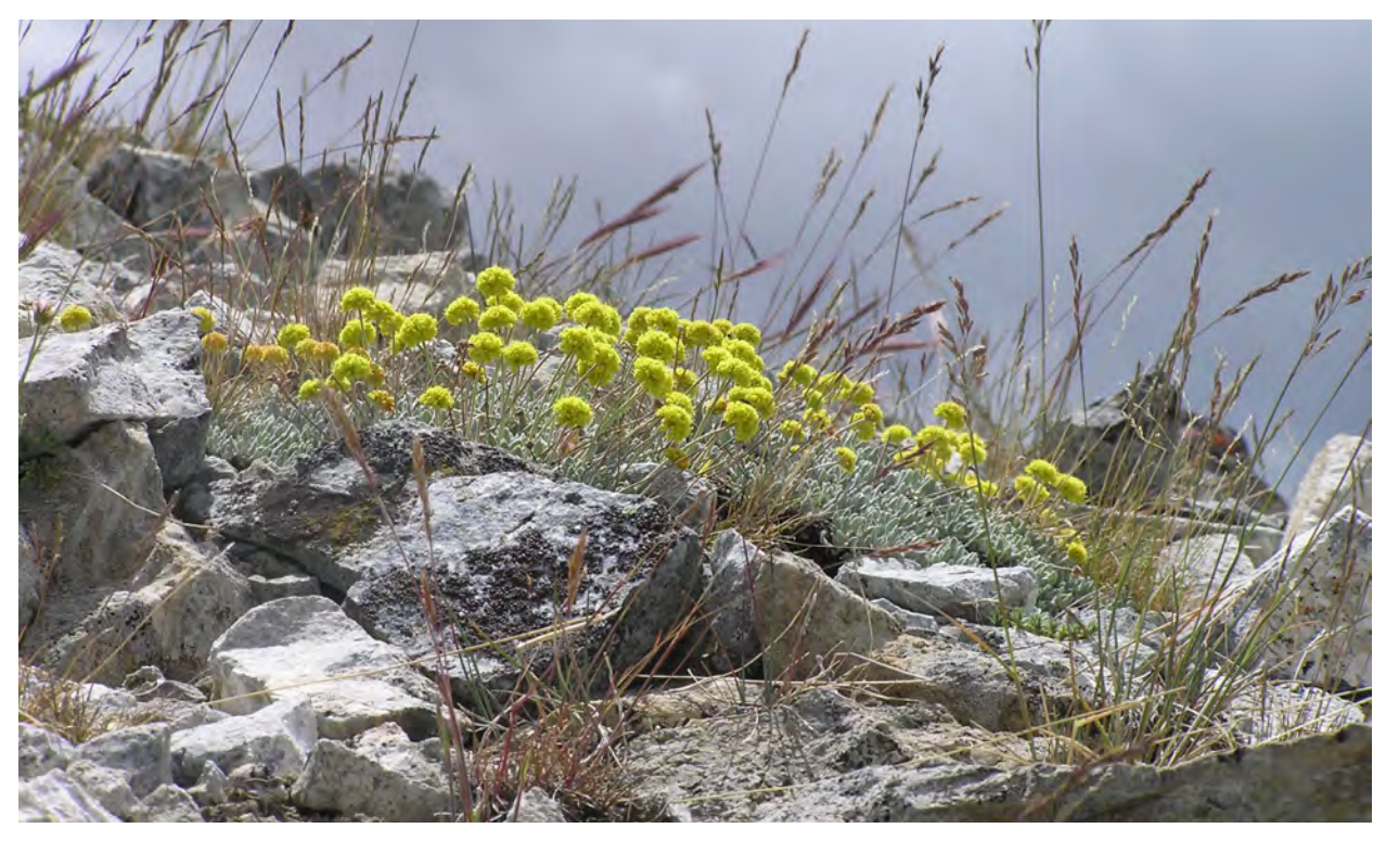
Wild buckwheat on Blackman Peak.

Boise State University Andrus Center for Public Policy