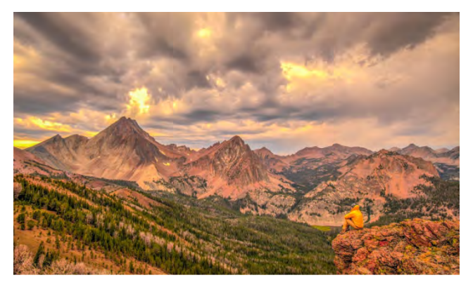
This vantage point looks down on Baker Lake and Little Boulder Creek, which would have been the site of a 700' deep, two-mile-long, open pit molybdenum mine if the area had not been protected by designation of the Sawtooth NRA.