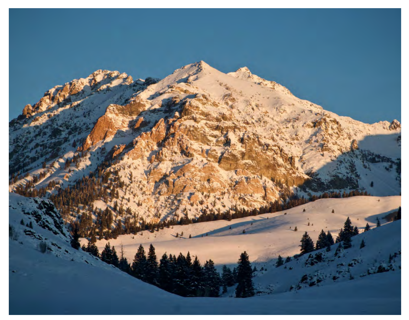
Sunrise glow in the Sawtooth National Forest.

The Center was pleased to convene a series of keynote speakers and panels that include many of the diverse perspectives on the Sawtooth NRA's past and future challenges. That list appears at the front of this conference report.