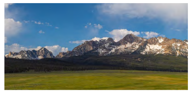
View of the Sawtooths from City of Stanley.

The most important long-range issue is the protection of our magnificent Idaho environment. We must not allow irreplaceable natural resources to be destroyed for temporary economic gain. We cannot tolerate the abuse and destruction of the White Clouds.